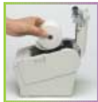
Drop-in paper load

In addition, the TM-T88III can print scannable horizontal or vertical barcodes, enabling customers to redeem money-off coupons or promotions quickly and efficiently in-store.