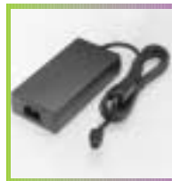
Power supply unit